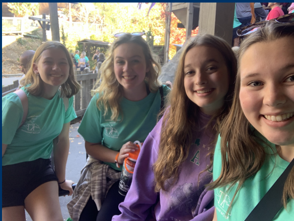
Fall Rally 2022

YOF grants are given to Key Clubs for service projects and can range from $250 to $2000. The first cycle of applications must be received by October 15, 2023. YOF grants create great opportunities and help your club conduct amazing service projects. Let me know if you have any questions!