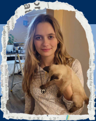
Aza Young Divison 1 LTG