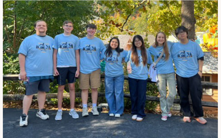
Division 12 group photo