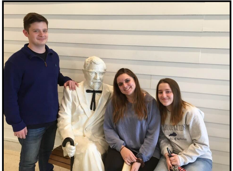
Lunch stop @ original KFC Spring Board Meeting 2018