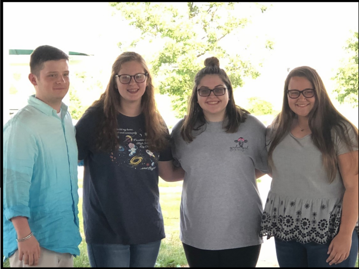
Franklin Co. High Pancake Breakfast Club Fundraiser June 2, 2018