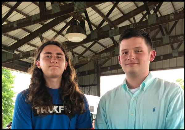
Franklin Co. High End of Year Picnic & Awards May 21, 2018