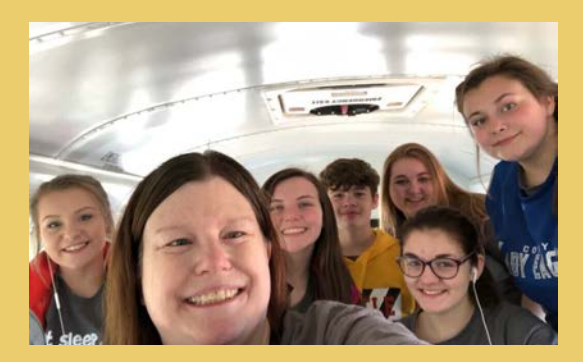
Congratulations Cosby High School for being recognized as a distinguished club!

Newsletters are a great way to update everyone about the latest happenings within the division. Please email me with contact information for your club officers as soon as possible. If your club hasn't had the chance to elect new officers for the 2020-2021 school year, don't worry. You can wait to do so when schools are back in session, or hold your election virtually.